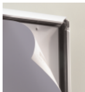
Graphics are easily changed by just replacing the old with the new.