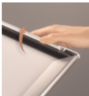
Rails easily snap open to replace graphics. Frames never need to be dismantled for new promotions.

Change graphics easily with a unique snap-open, snap-closed hinge.